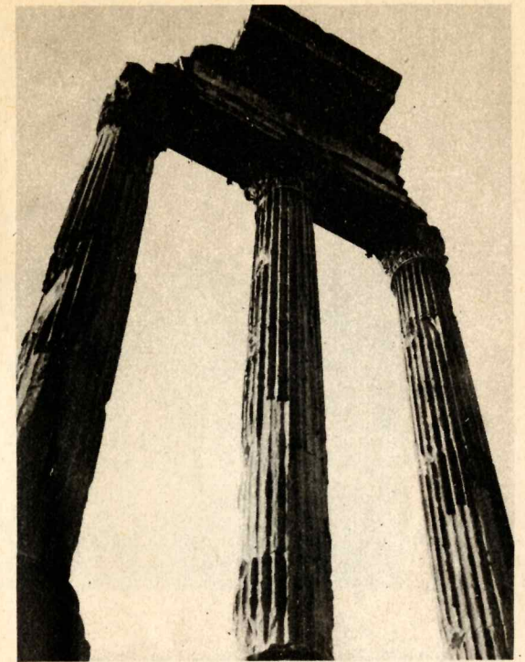
TEMPLE OF CASTOR & POLLUX

Imperial Rome was not merely the centre of government of the Mediterranean World for four centuries; it was also a cultural and artistic centre, each emperor making his own contribution towards the city's glories. Augustus boasted that he found Rome built of brick and left it built of marble. In this way Rome became a city of beautiful temples and public buildings, and also of places of amusement, such as baths and theatres. Within the Roman Empire the people enjoyed peace and good government. Roman citizenship, which carried with it many privileges and rights (as St. Paul knew), was bestowed on an increasingly wide scale to individuals as a reward for services rendered to Rome and to communities in recognition of their rising standard of civilisation. Provincial governors were subject to very strict control and there were safeguards against exploitation of subject peoples. Some of the conquered countries assimilated Roman ideas and manners very quickly. By the end of the first century A.D. Spain gave Rome the Emperor Trajan, who added a new province (the modern Rumania) to the Empire. The column commemorating his victories can still be seen in the City. The first two centuries after the birth of Christ saw the Roman Empire at its highest stage of development. In was