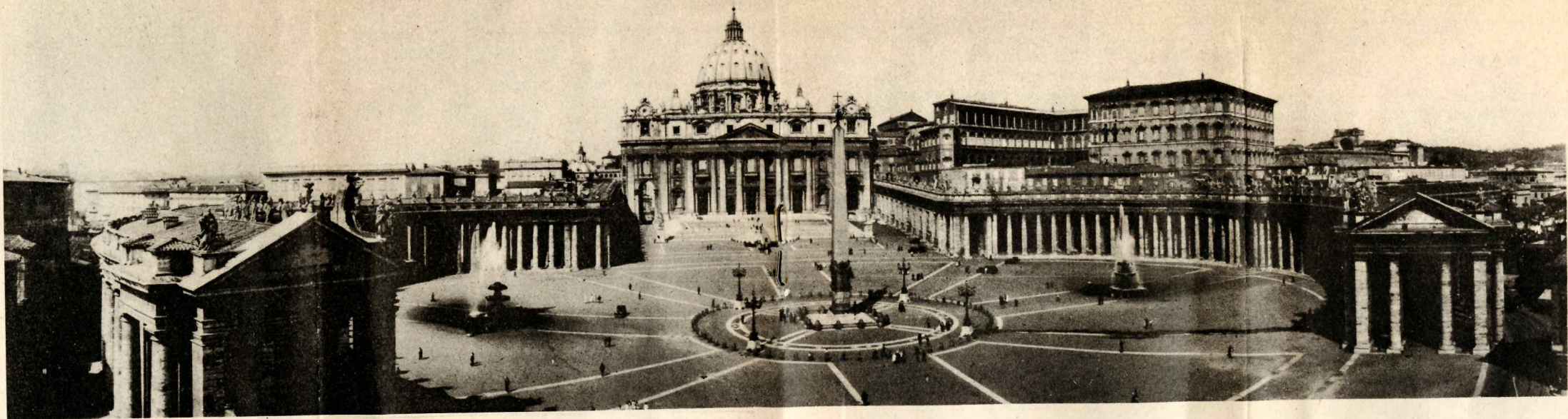
ST PETER'S AND THE VATICAN