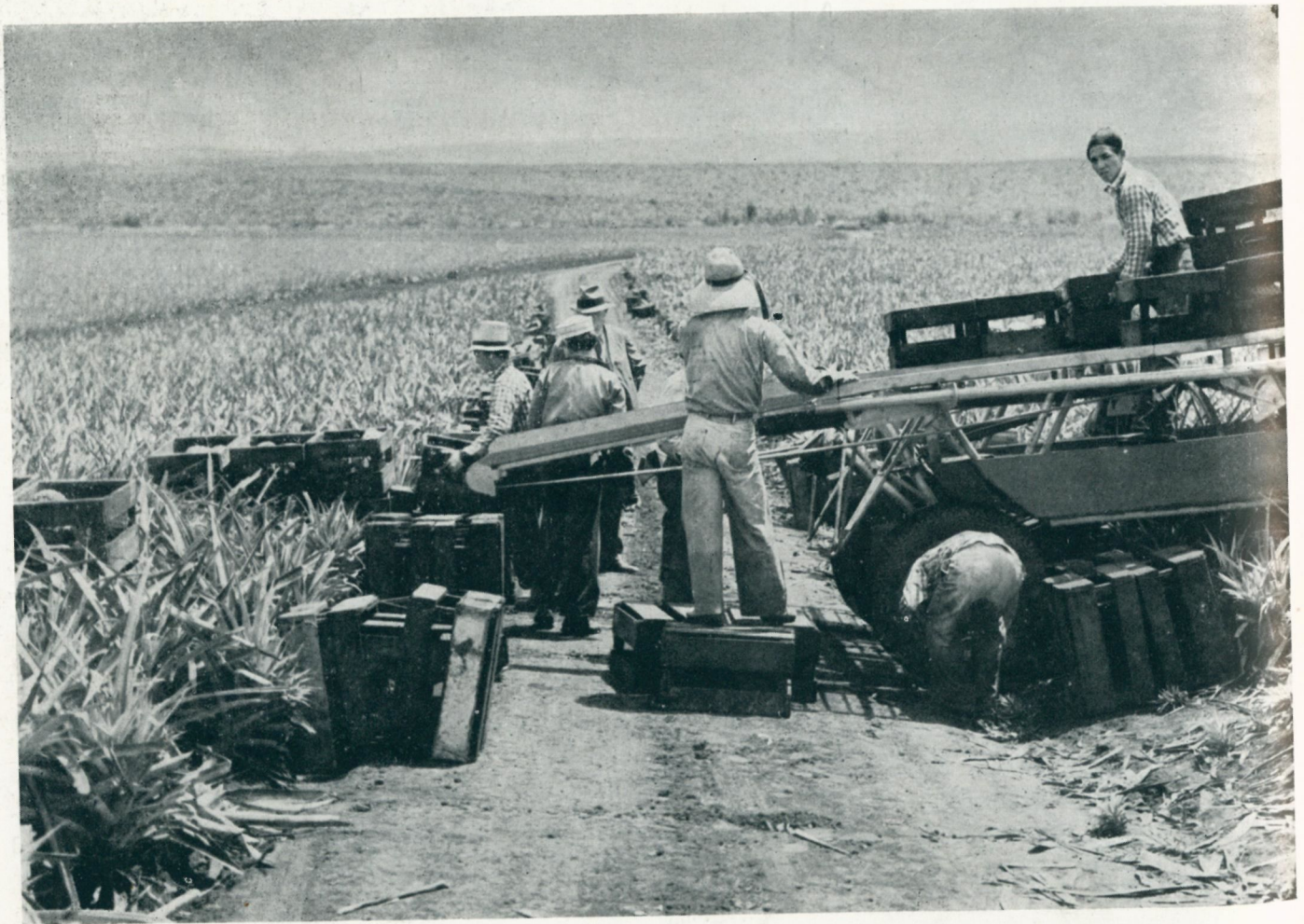
MACHINERY HELPS TO HARVEST PINEAPPLES AT "BRODIE CAMP"

Why not run a honeymoon Special Air Clipper from Honolulu to Midway and Wake Islands? Over the Honeymoon Air Line!