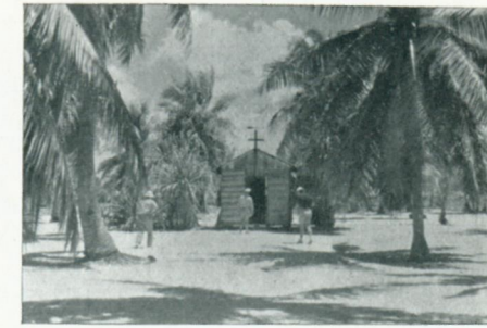
Chapel on Christmas Island

Telephone 5948 424 South Beretania St. Honolulu