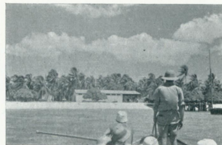
Dock at Christmas Island

The Associated Press at Suva, Fiji Islands, on February 20, 1937, reported that the sloop Leith departed, that day "with a Fiji Government wireless officer and complete radio plant for Christmas Island." The New York Times , February 21, 1937, explained that "the sailing indicated Great Britain intended to perfect her claim to Christmas Island, the largest and most desirable of a number of scattered mid-Pacific islands whose