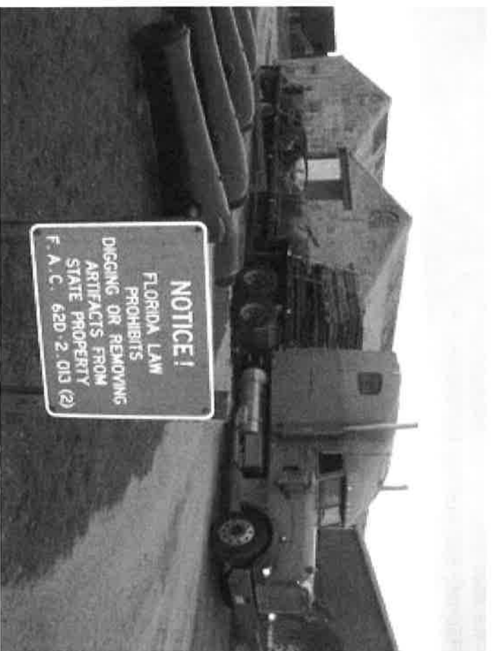
A truck leaves Fort Taylor carrying artifacts past a sign that forbids the removal of artifacts from the fort.

Major allocations of money were repeatedly requested to preserve and repair the fort but they were all turned down and recent hurricane damage made continued storage of the artifacts unwise. The fort has been widely known as "Fort Forgotten" because it has received so little funding over the years. In fact, the Fort Taylor State Historic Park has received so little funding that volunteers do most of the