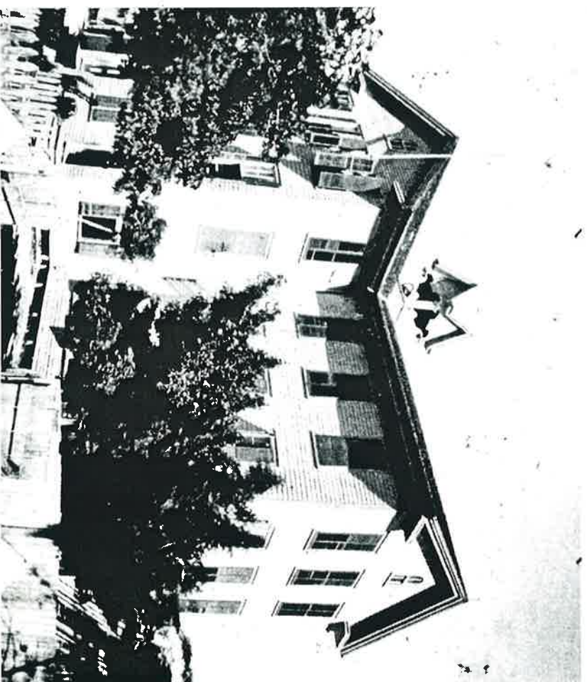
Sears School Key West's first public school.