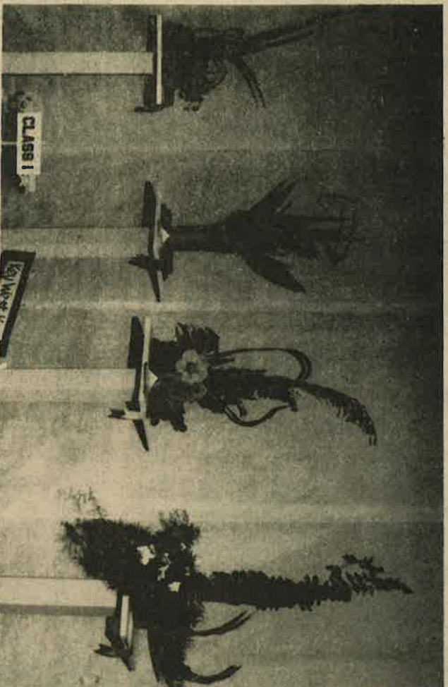
Class 1 Exhibits representing Key West as shown at the Upper Keys Garden Club Flower Show.