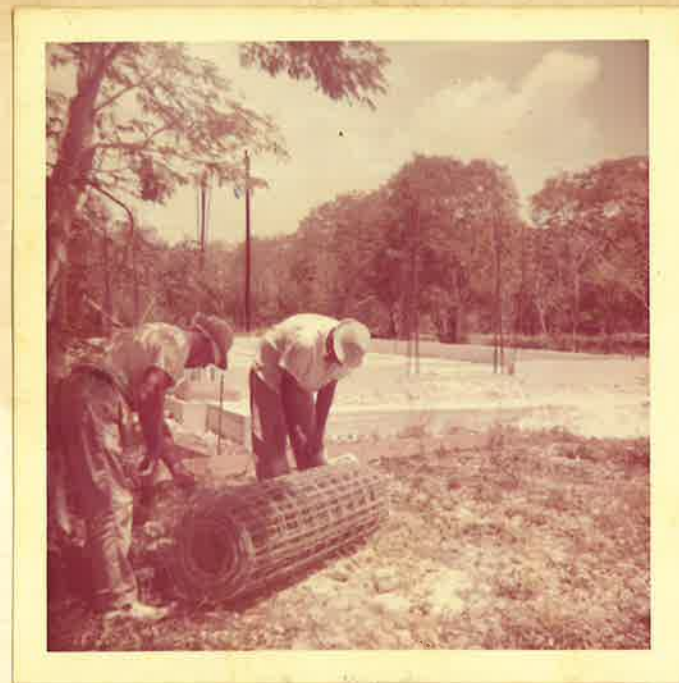
BEGINNING OF CONSTRUCTION