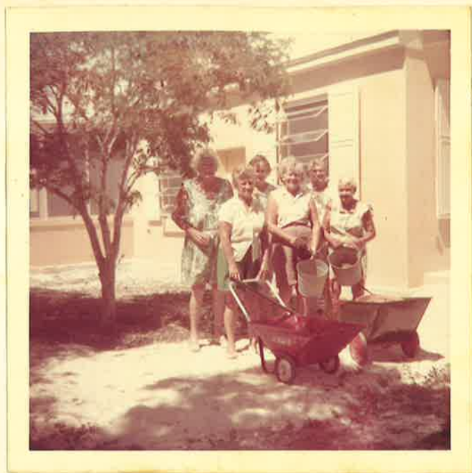
GARDEN CLUB MEMBERS CLEARING UP THE GROUNDS AROUND THE CENTER