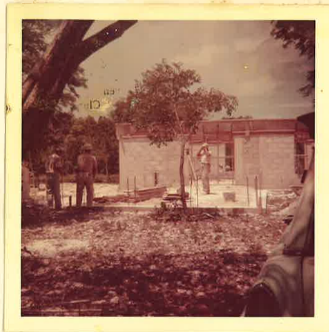
WORKING ON THE WALLS