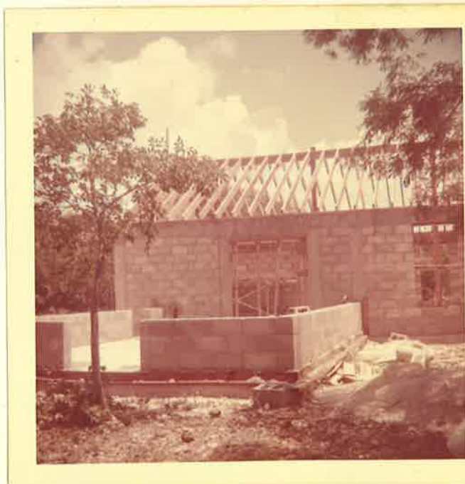
SCREENED PATIO UNDER CONSTRUCTION