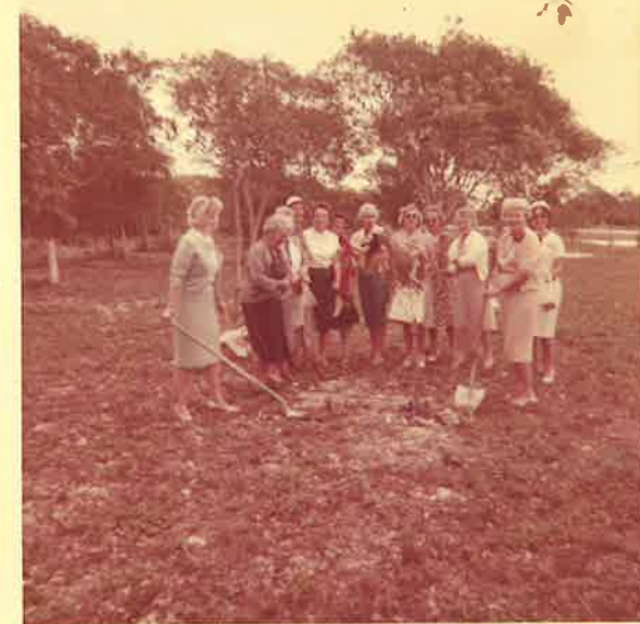
PLANTING THE FIRST MEMORIAL TREE IN THE SECTION SET ASIDE FOR OUR MEMORIAL GARDEN