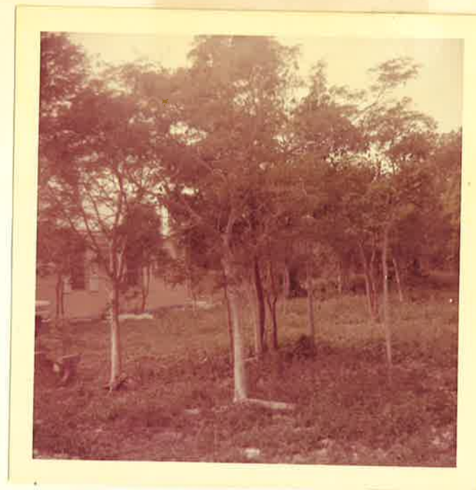
THESE ARE A FEW OF THE MANY TREES NATIVE TO THE KEYS RETAINED ON THE PROPERTY

Mrs. Gasser said club members plan to beautify the property with many native flowers, trees and shrubs. A number of native trees already stand on the piece of land, which is adjacent to the entrance to Sunset Gardens about two miles north of Tavernier.