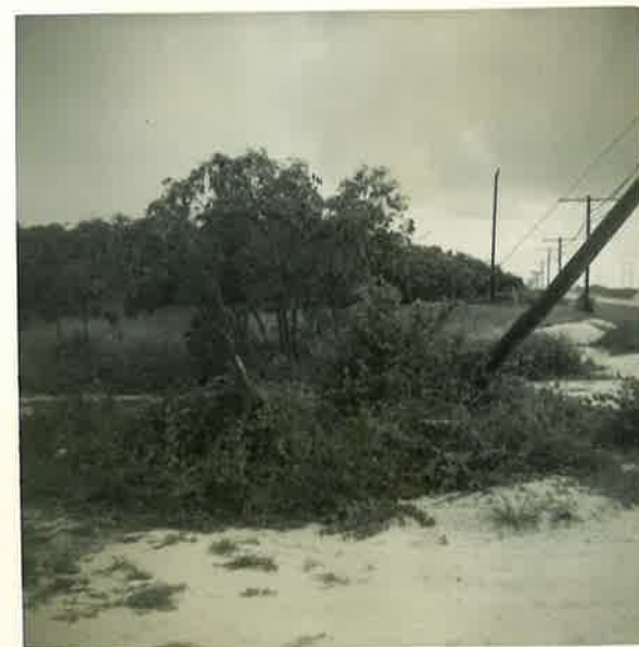
PART OF THE PROPERTY