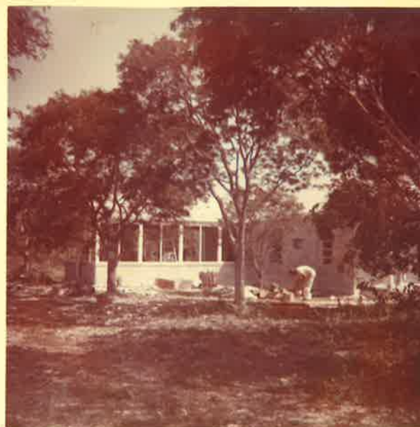
FRANCIS GARDEN CENTER NEARING COMPLETION