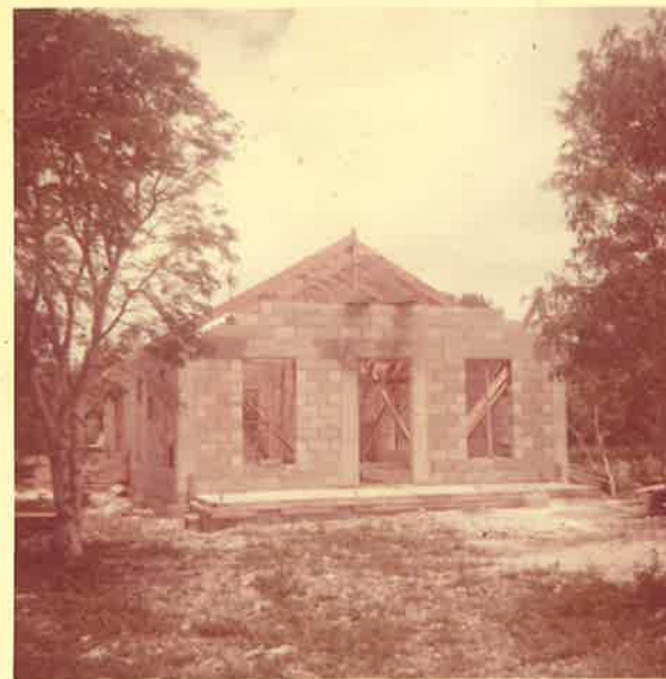
ROOF UNDER CONSTRUCTION