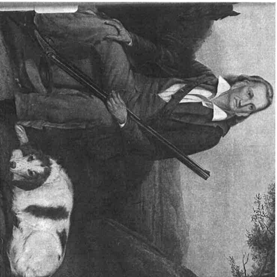
John J. Audubon and his dog.