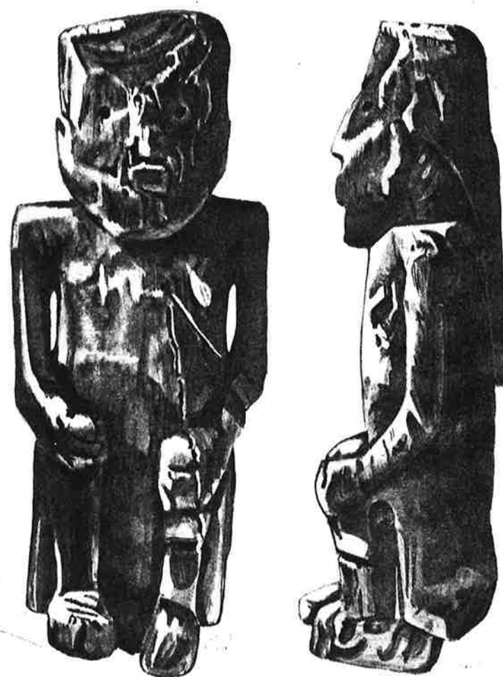
Front and side views of Wooden Idol, North Shore Lake Okeechobee, Florida. Cat. No. 316,254, U. S. National Museum.

Cushing associated certain wooden slabs that he discovered in the muck at Key Marco with altars and suggested that they were used in worship. The two specimens here illustrated (pls. 2 and 3) are made of soft wood (cypress or pine). They were presented to the U. S. National Museum by Mr. George Kinzie. One of them (pl. 2) is incised on the surface with a circle and cross, as if to represent the sun and a cosmic direction symbol. The form of the other (pl. 3) is different from that of any known wooden object from the region, but it is likewise decorated with an incised cross and straight and curved lines.