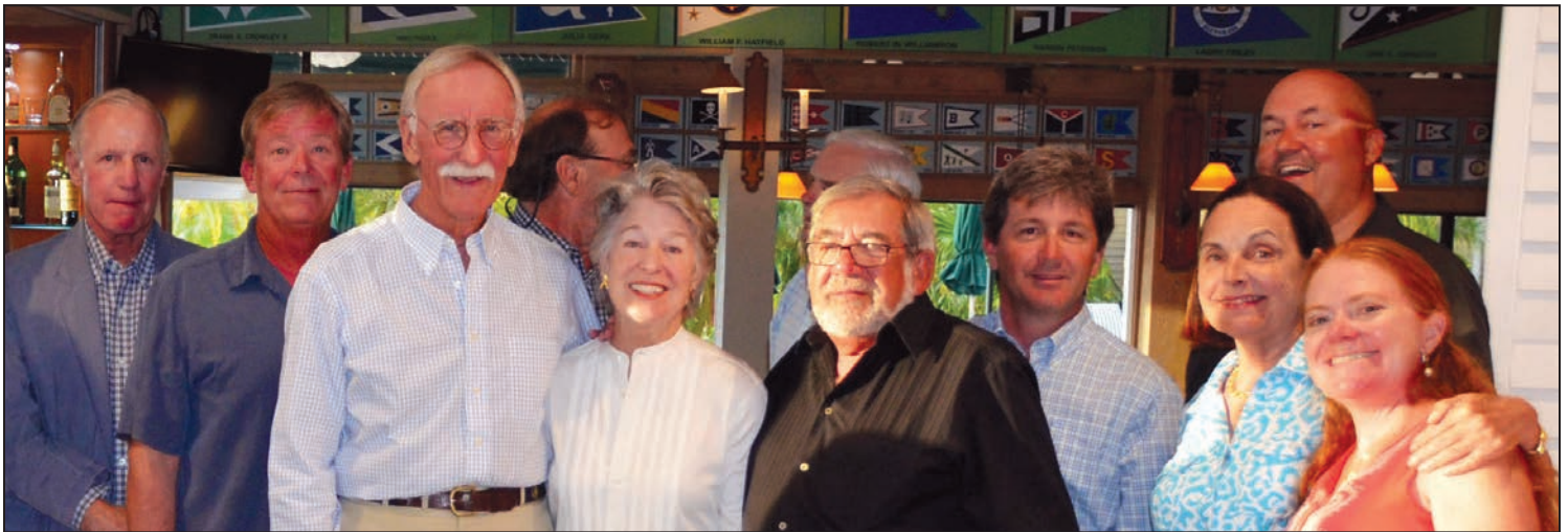
Flats Fishing Tournament participants enjoying the Awards Banquet!

In Summer The Fish Are Most Plentiful... But Not The Fisherman.