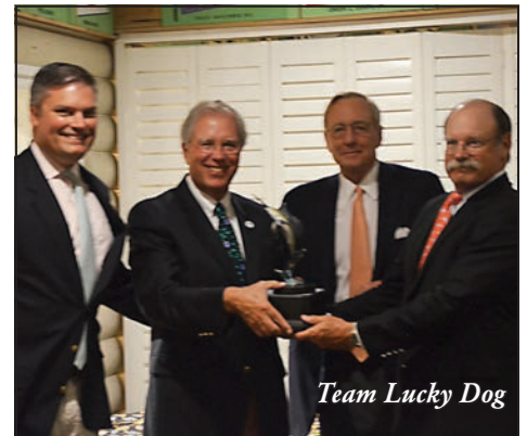
Team Lucky Dog