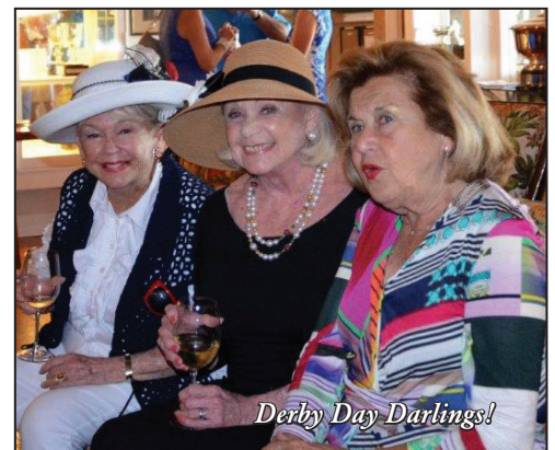
Derby Day Darlings!