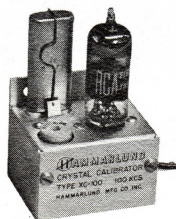
100 kHz CRYSTAL CALIBRATOR

DIMENSIONS ..... 16½" wide, 8" high, 9½" deep. Weight: 22 lbs. Shipping Wt.: 26 lbs. Specifications and price subject to change without notice.