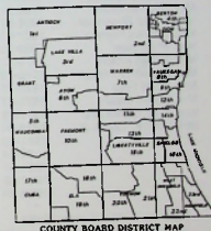
COUNTY BOARD DISTRICT MAP