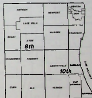
U.S. CONGRESSIONAL DISTRICT MAP

102 Wilmot Road, Suite 200 Deerfield, IL 60015 (708) 940-0202 (708) 940-7143 - Fax