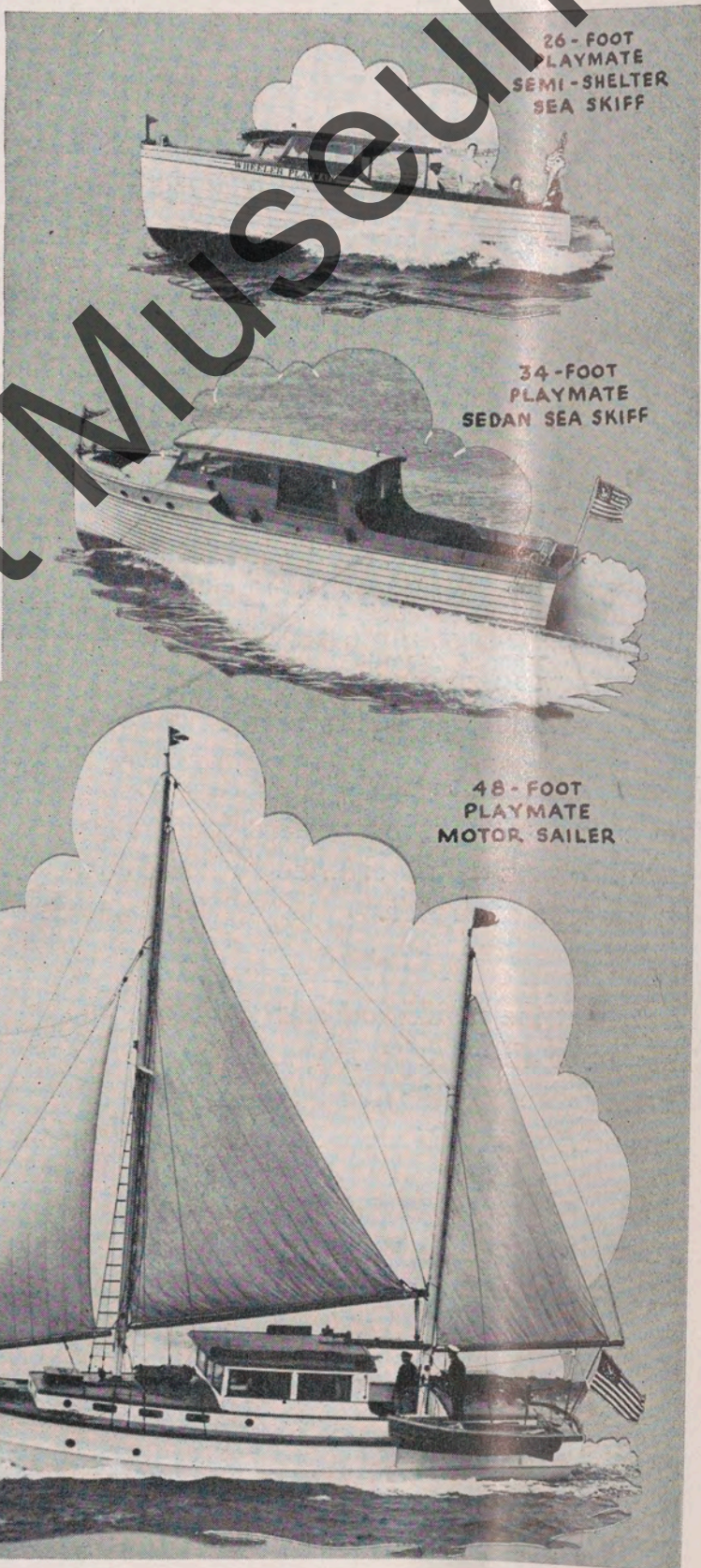
26-FOOT PLAYMATE SEMI-SHELTER SEA SKIFF

We have a large selection of used standardized and custom built cruisers of popular makes which were traded-in for Wheeler Playmates. These boats have been reconditioned and are ready for immediate service. Write today for complete list of used boats.