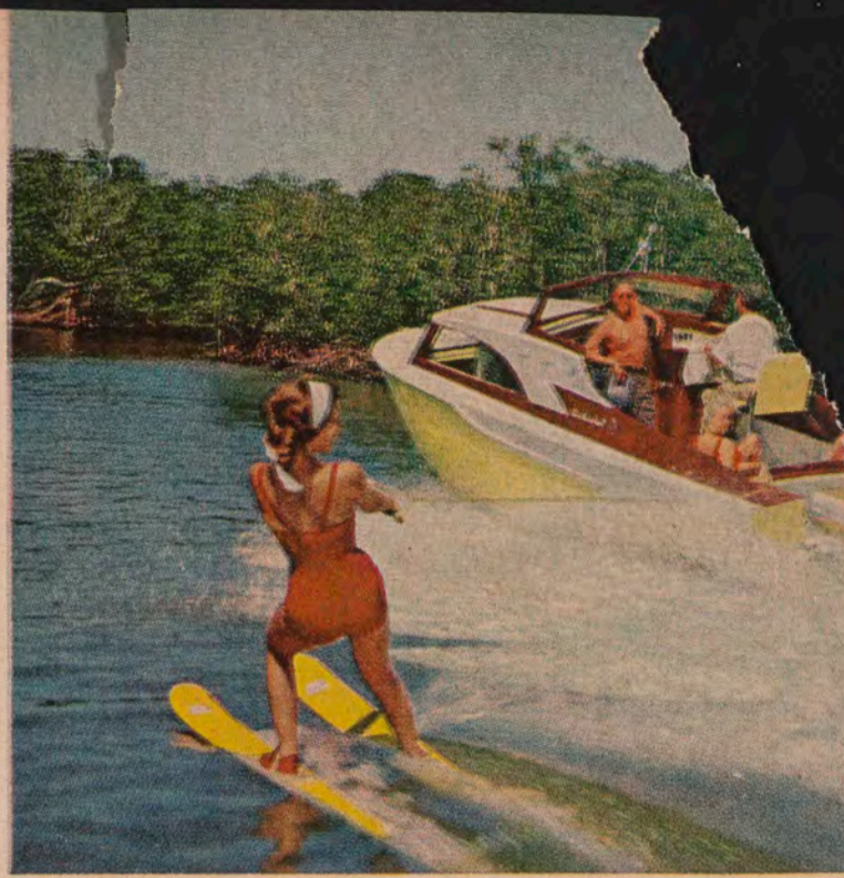
Ideal for skiing! The Super Sea-Horse 35 is very strong alone, and when teamed with another. Other 35 hp Johnsons at $585 and $4