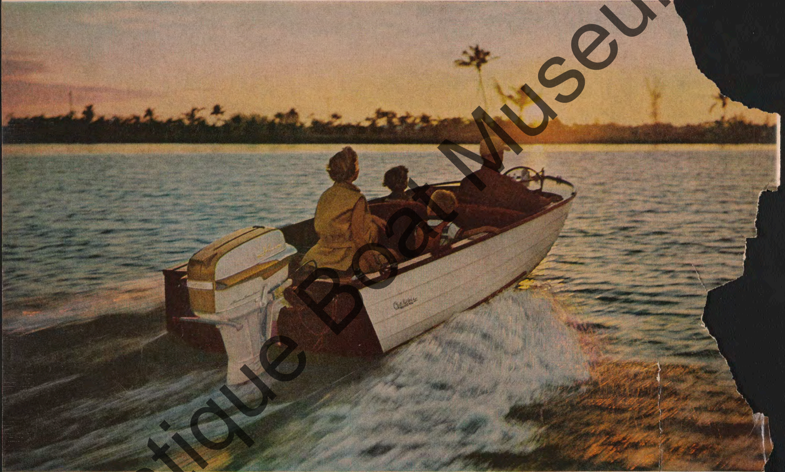
New Super Sea-Horse 35. 12-volt electric starting. 35 hp. $625.