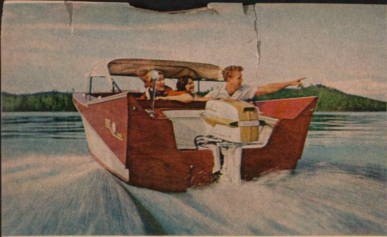
Driving force for fun! New Super Sea-Horse 35 powers anything from runabouts to cruisers. The turn of a key starts it . . . and stops it.