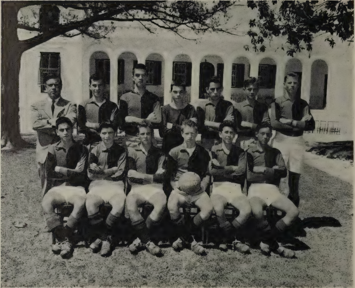
FIRST XI SOCCER, 1949-50