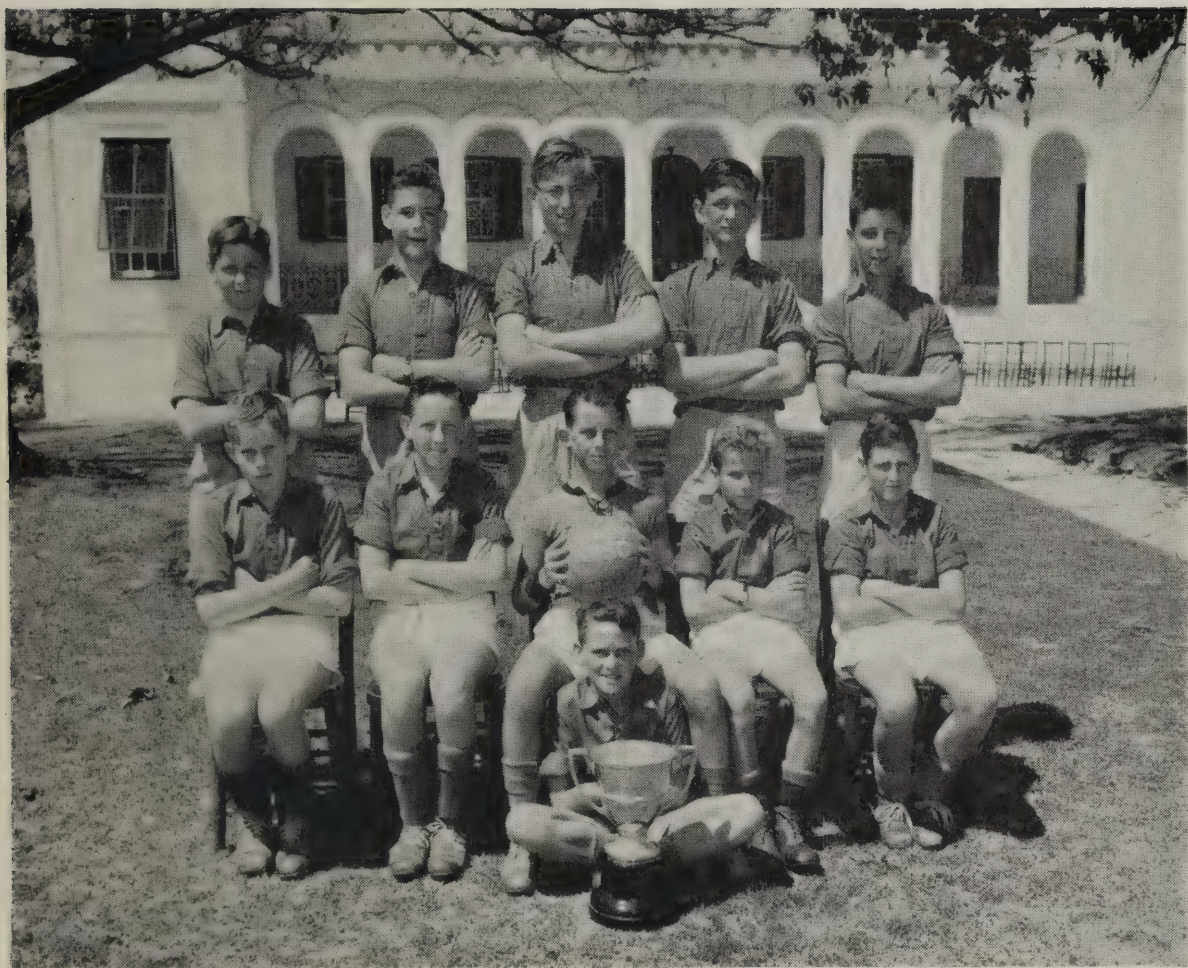
JUNIOR LEAGUE XI, 1949-50 Winners Inter-School Soccer Competition