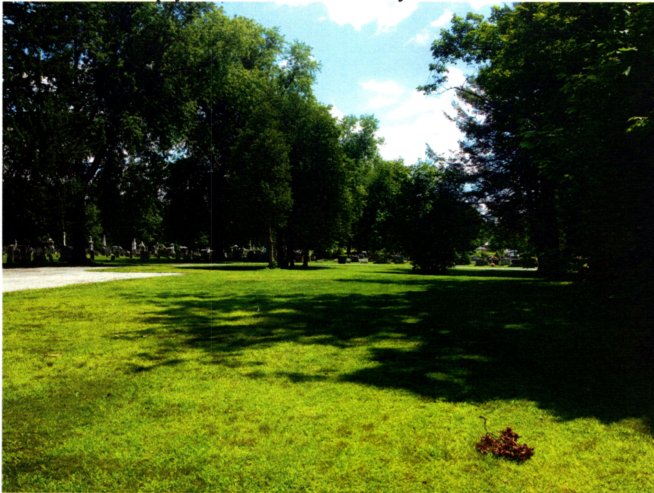
Moul House- empty lot, 57 South Broadway

GOES WITH RED HOOK EMPORIUM SCHOOL DISTRICT # 4