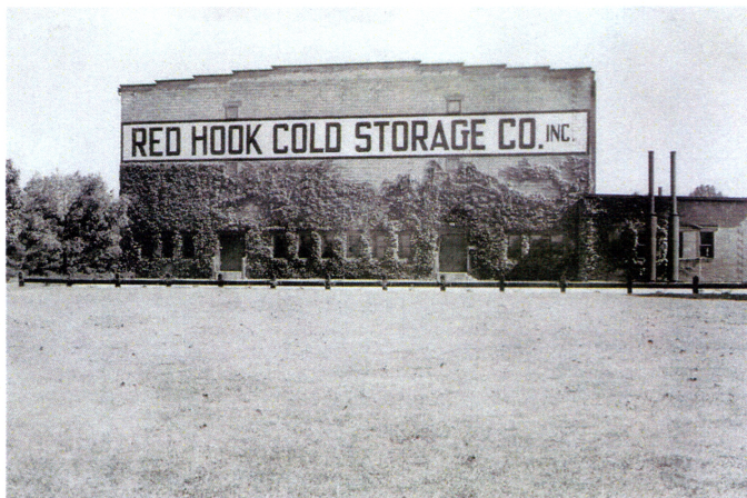
Chanler Park- behind Tribel's garage, where Old Farm Rd meets Red Hook Estates, 7317 South Broadway