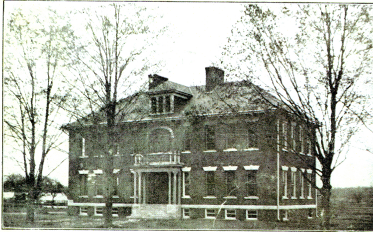
Union Free School.