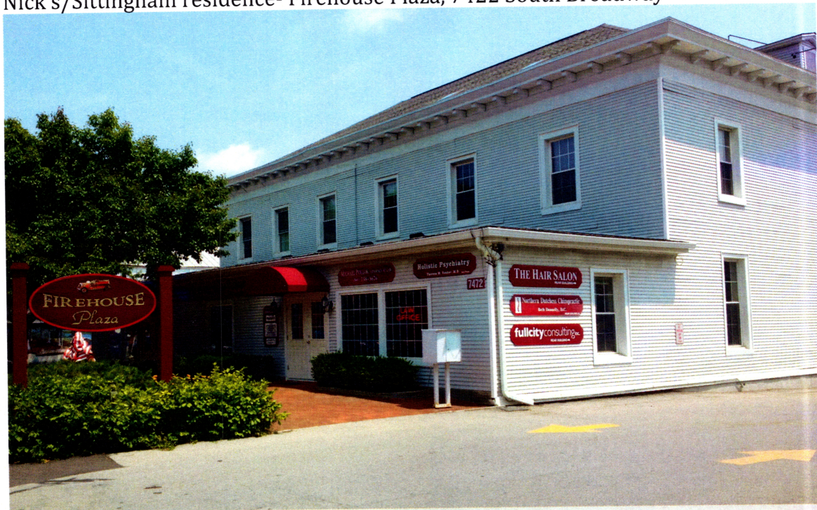
Nick's/Sittingham residence- Firehouse Plaza, 7422 South Broadway