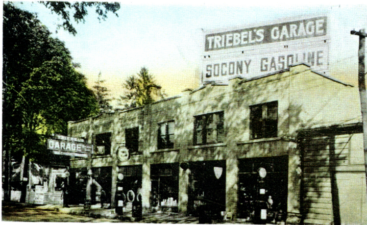
TRIEBEL'S GARAGE, Red Hook, N Y