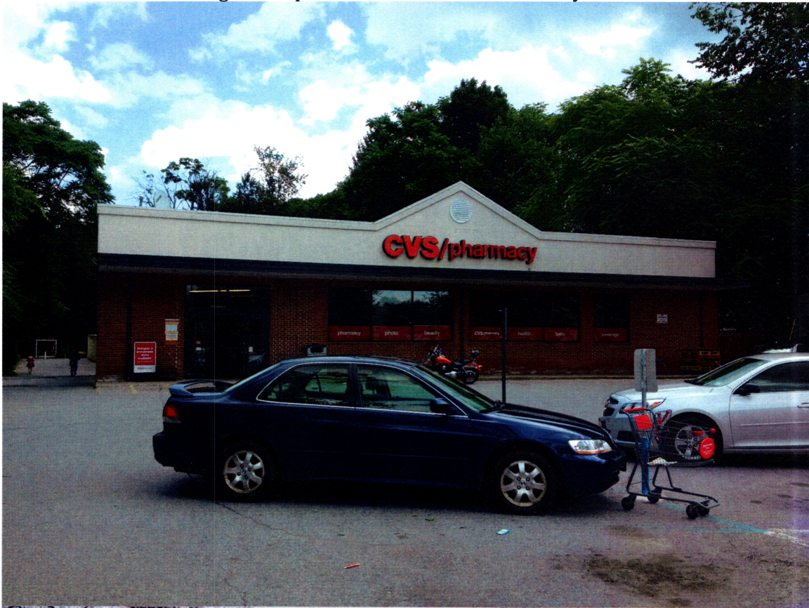
Anderson House & Wagon Shop -CVS, 7518 North Broadway