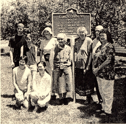
The sign dedication included Junior Friends of Elmendorph Club members, Friends of Elmendorph Board members and Etc. Thrift Shop Volunteers.

T his past school year the Junior Friends of Elmendorph, a club based at Red Hook High School, raised more than $600 with additional funds added by the Linden Ave. School Student Council to buy a historic marker for the Elmendorph Inn.