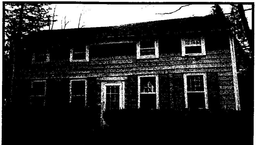
November 2008

St Paul's Lutheran Cemetery caretaker's house South Broadway, Red Hook, New York