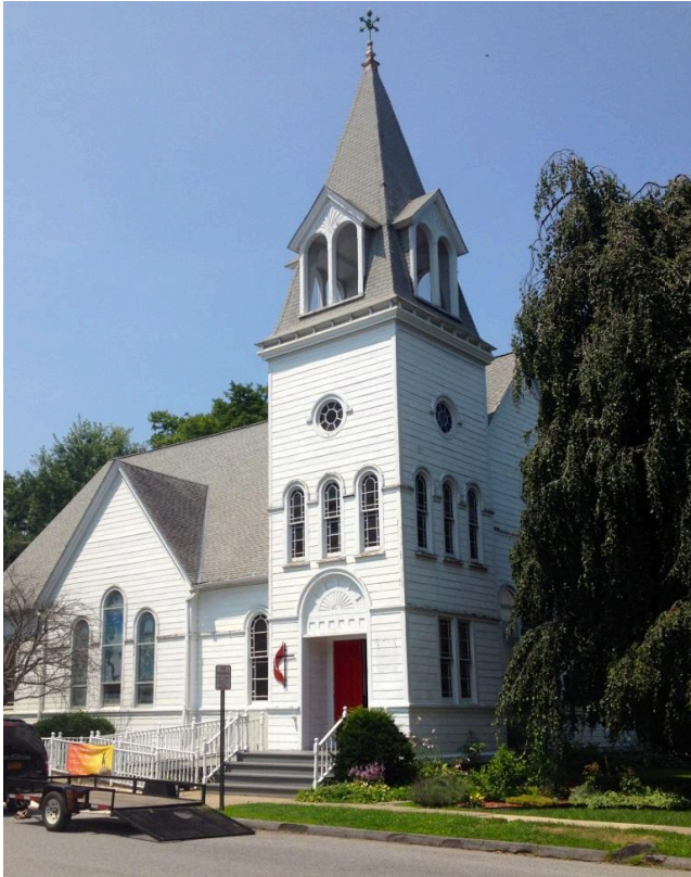
Methodist Church, 50 West Market Street