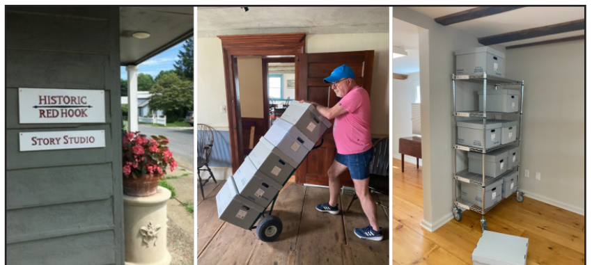
Volunteers have been hard at work the past several months preparing and moving our collections into the StoryStudio.