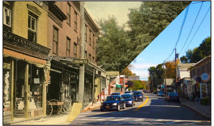
Postcard from HRH collections showing East Market Street in the early 20th c. and photo of Market St. today.

And so, we invite you to join us on Saturday June 3rd from 11 am until 4 pm for our Then and Now