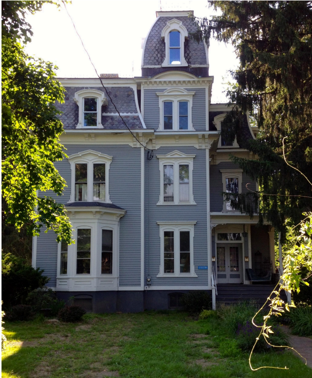
7579 Old Post Road (R2)