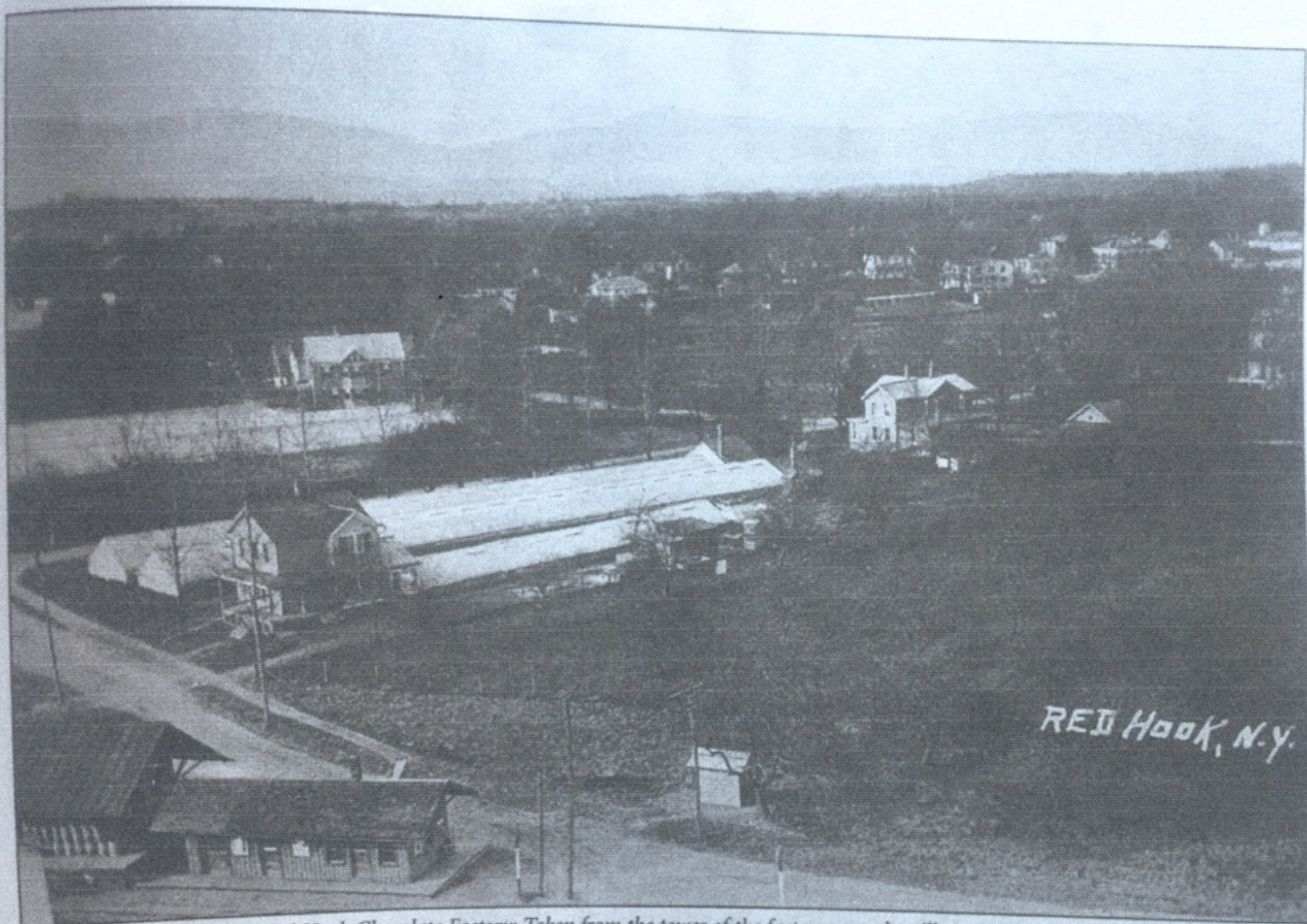
Bird's Eye View from the Red Hook Chocolate Factory: Taken from the tower of the factory near the village depot, looking northwest, c. 1890. This overview shows the relative sparseness of most of the rural village. Practically every house had a large vegetable garden and a berry patch or grape vines. Household chickens and small penned animals were also common in backyards, and streets were unpaved. Note the violet greenhouses.