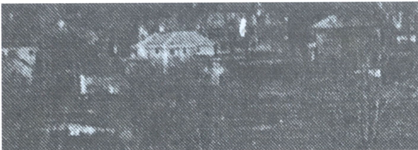
Source: House Appears "Birds-eye" in Photo from Chocolate Factory c.1890 in "A Brief History of Red Hook"