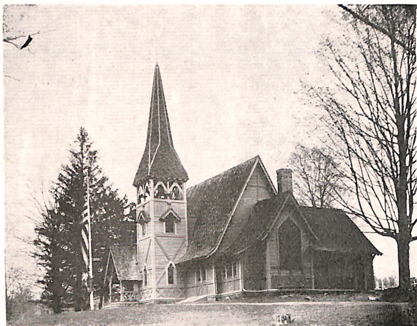
Early picture of St. John the Evangelist