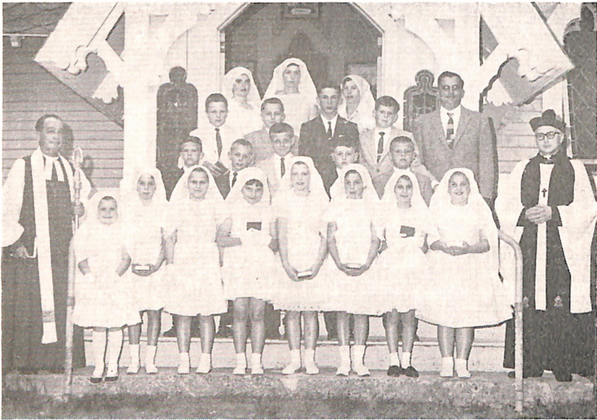
Confirmation Class 1963