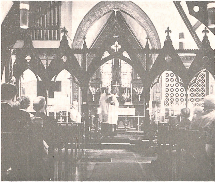
90th Anniversary Cornerstone Laying May 9, 1964