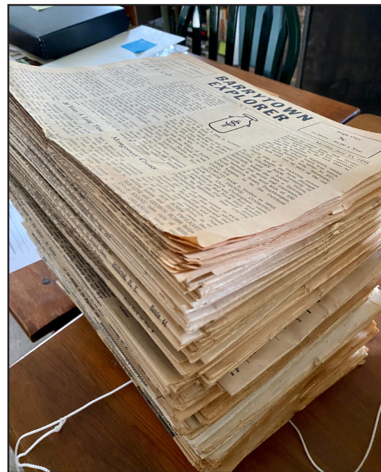
To prepare for digitization and prevent deterioration, these papers will be unfolded and re-housed in acid free archival boxes.