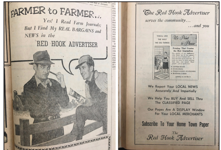
Red Hook Advertiser ads, December 19, 1957