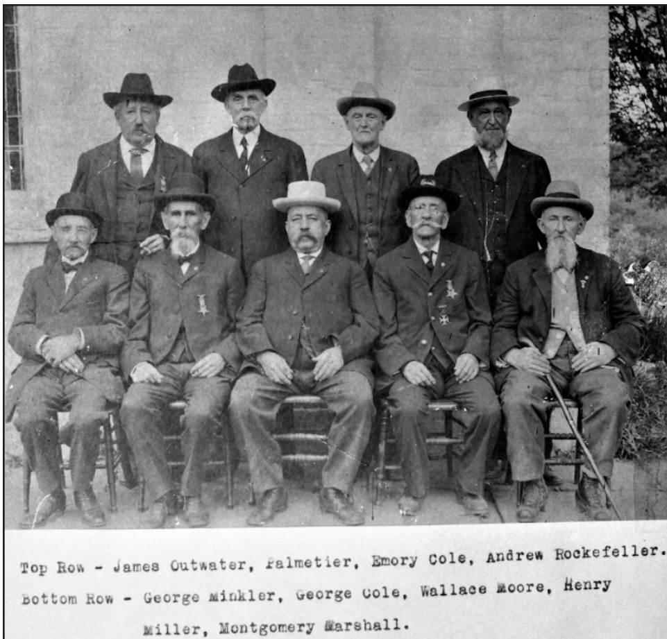
Nine Tivoli Civil War veterans, c. 1908