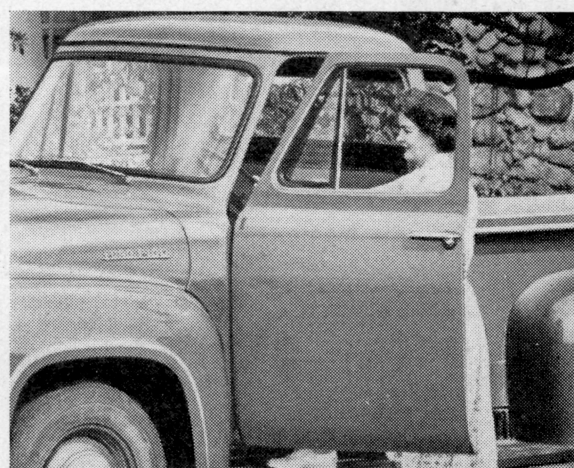
"My wife was surprised how smart the new truck looked inside and out." Ford's new free-breathing woven plastic upholstery is practical as well as smart. It rides cooler, is easier to clean.