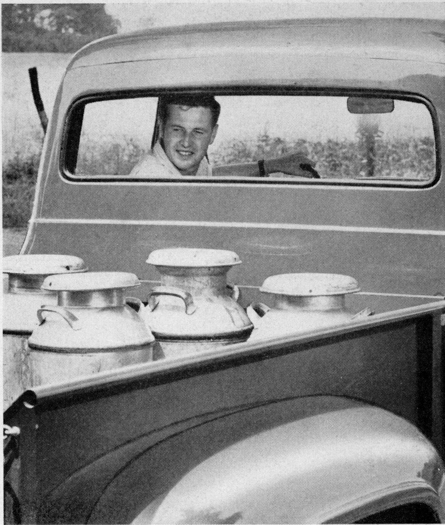
"It's a greenhouse on wheels." Ford's visibility unlimited with big one-piece curved windshield and 4-ft.-wide rear window makes maneuvering in tight spots easy. Short turning circle is a real help, too.