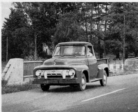
"Gas mileage is good, much better than you'd expect from such a powerful engine." Low-FRICTION, high torque design of Ford's 115-h.p. Six gets more power from every drop of gas.