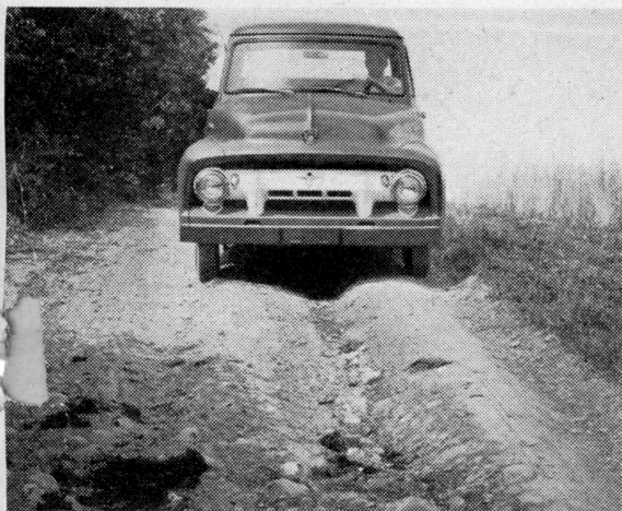
"Goes great in tough going." The high, 5900-lbs. total axle capacity of Mr. Teator's Pickup—higher than any other pickup—is just one reason for its dependable performance.