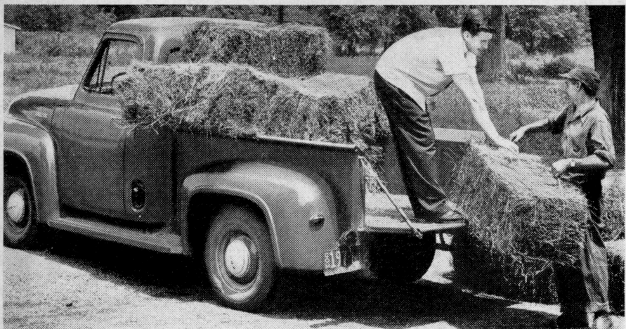
"Lots of load space. You couldn't put a bigger pickup box on a 1/2-tonner." Hay bales are bulky, but Mr. Teator's son Ronnie finds there's plenty of room for a big load. Extra-strong tailgate makes loading easier, too.