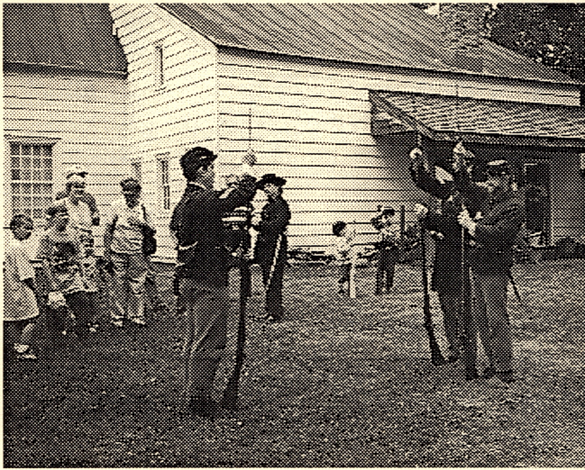
Civil War soldiers prepare their muskets for firing at the living history reenactment presented at the Elmendorph Inn in July.