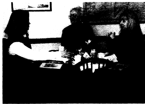
Guests Enjoying the Program