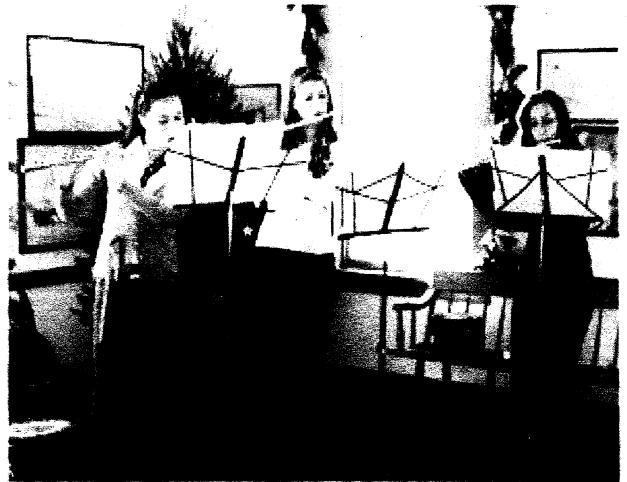
Red Hook High School students provide music