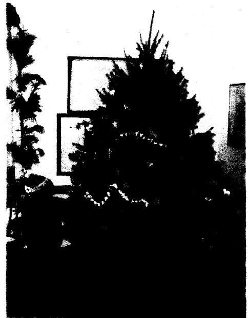
Decorating the tree