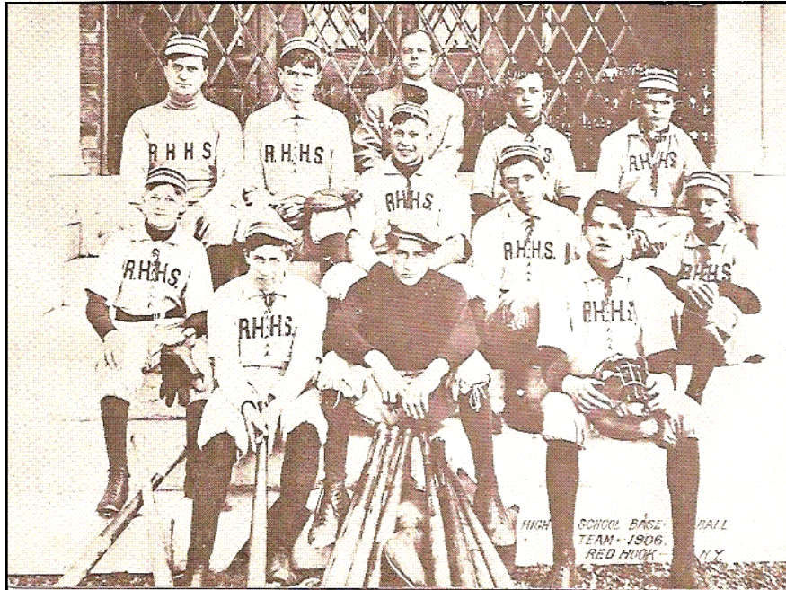
The Red Hook High School Baseball Team of 1906. Can you identify any of the players?