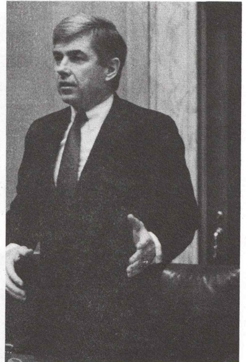
Congressman Jack Kemp (R-NY)

The hosts for the event were Senator Gary Hart (D-CO), Senator John Heinz (R-PA), Congressman Dante Fascell (D-FL), and Congressman Jack Kemp (R-NY).