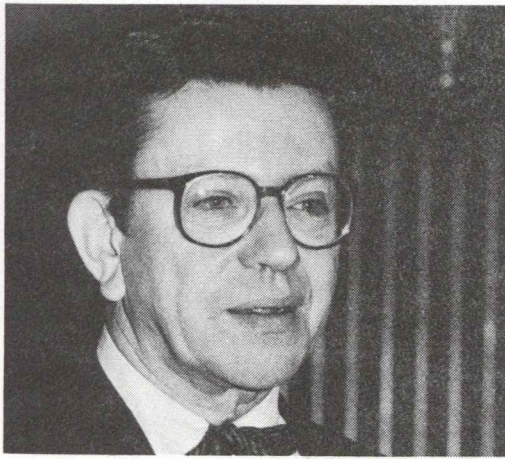
Senator Paul Simon (D-IL)