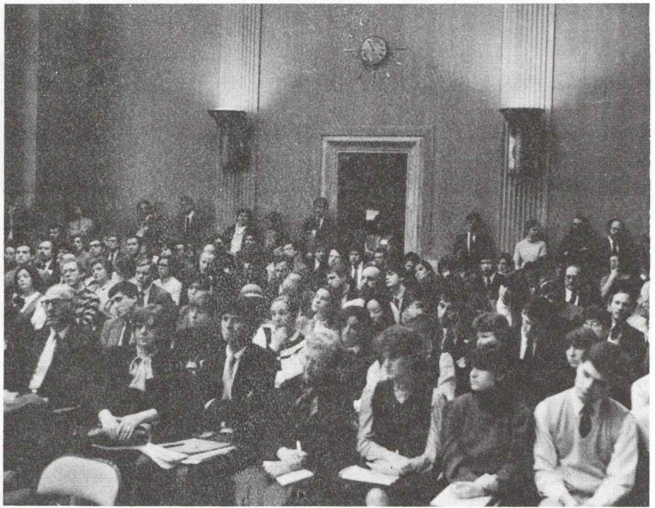
UCSJ Congressional Briefing draws record attendance.