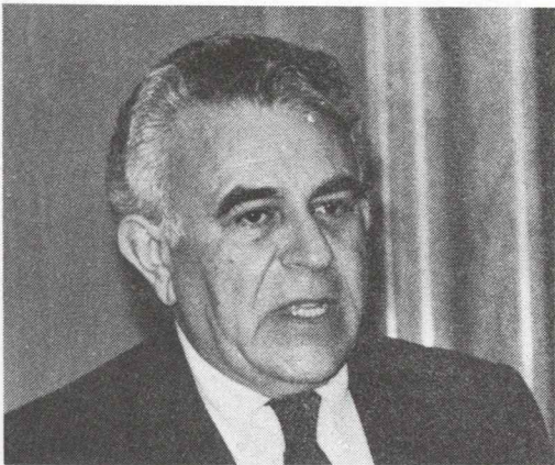
Representative Benjamin A. Gilman (R-NY)