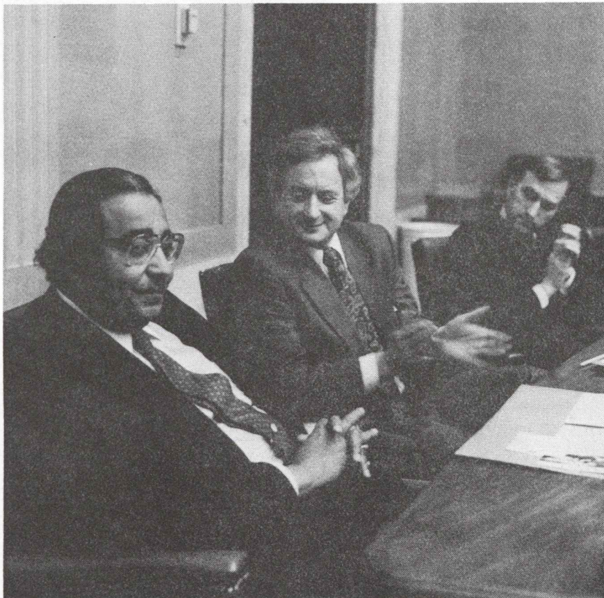
(From r. to l.) Assist. Sec. of State for Human Rights and Humanitarian Affairs Elliott Abrams, Rep. Sander Levin (D-MI), and Rep. Charles B. Rangel (D-NY).