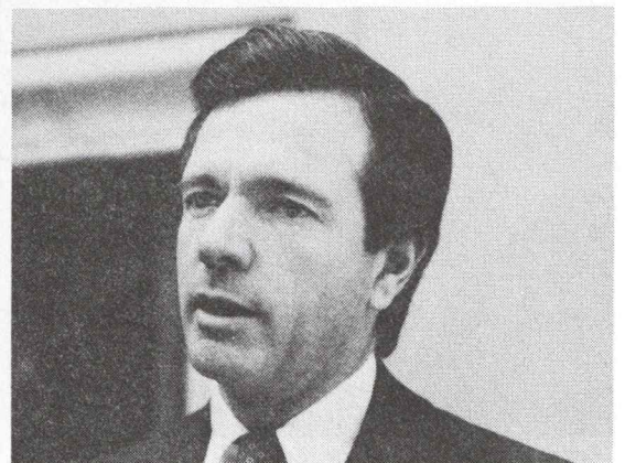
Senator John Heinz (R-PA)