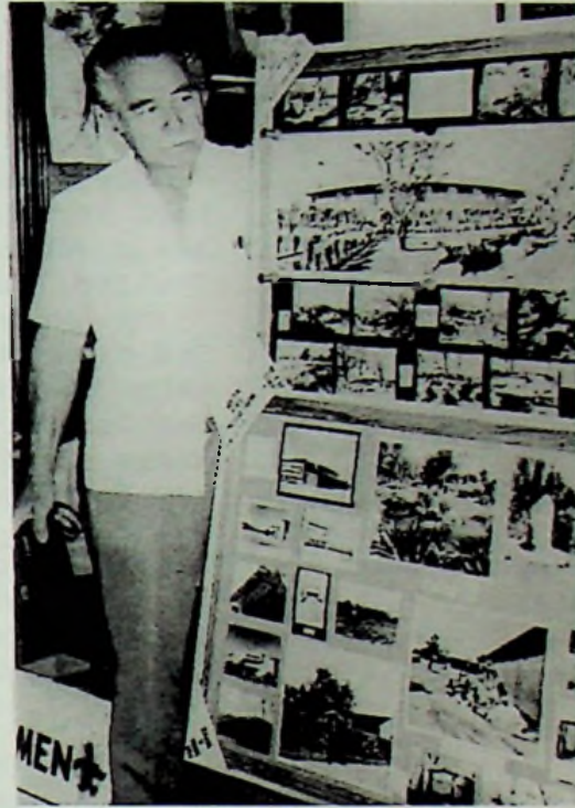
Shi and Manzanar Photo Exhibit Eastern California Museum