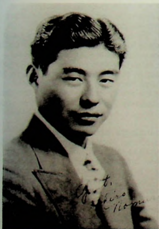
Senior Picture Banning High School 1937