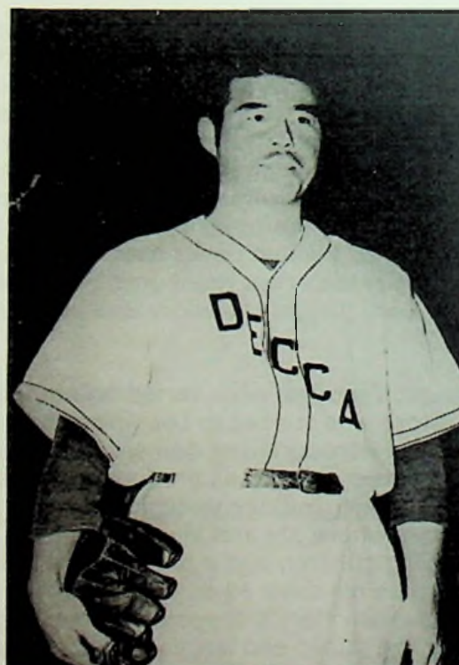
Baseball 1946-47 Decca Records Company