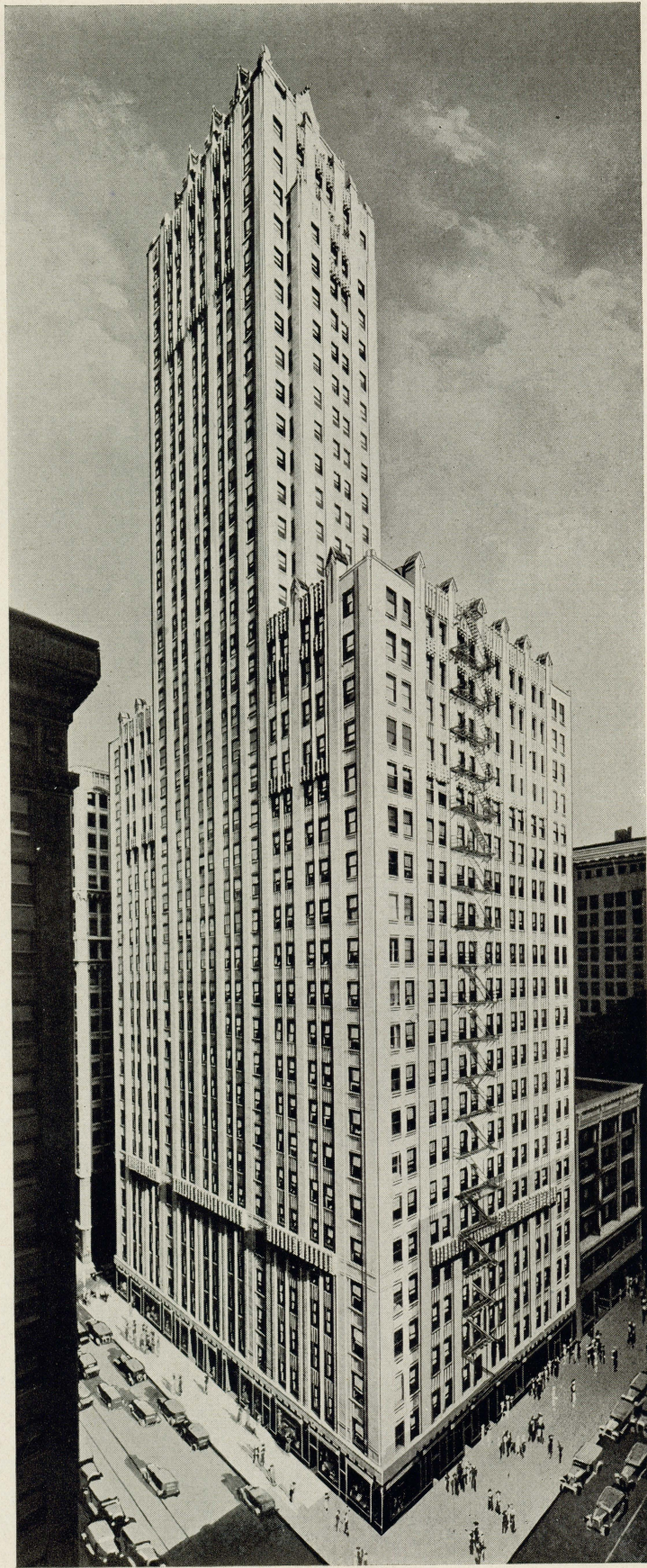
PITTSFIELD BUILDING, CHICAGO, ILLINOIS