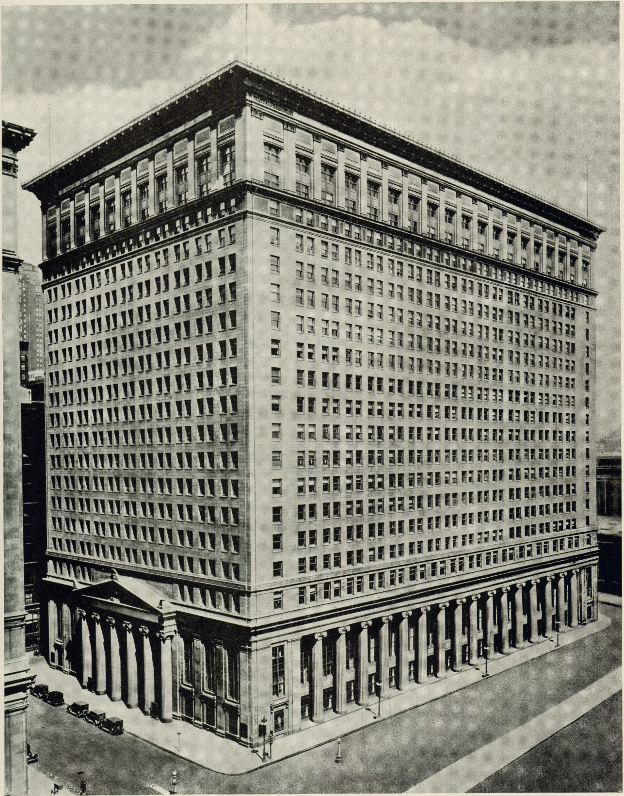
CONTINENTAL - ILLINOIS NATIONAL BANK & TRUST CO. BUILDING, CHICAGO, ILLINOIS

Graham, Anderson, Probst & White, Architects