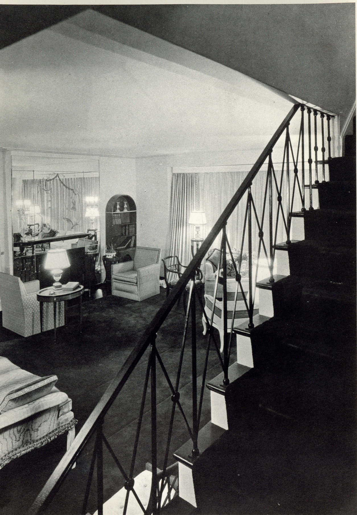
VIEW OF LIVING ROOM FROM STAIRWAY